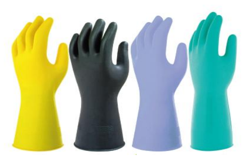
Marigold (NOT other brands) durable gloves