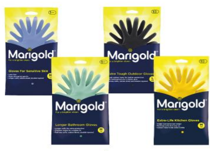
Marigold (NOT other brands) gloves packaging

All brands of flexible plastic and metallic plastic tubes used for body creams, ointments or moisturisers